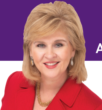
Your PBS Charlotte